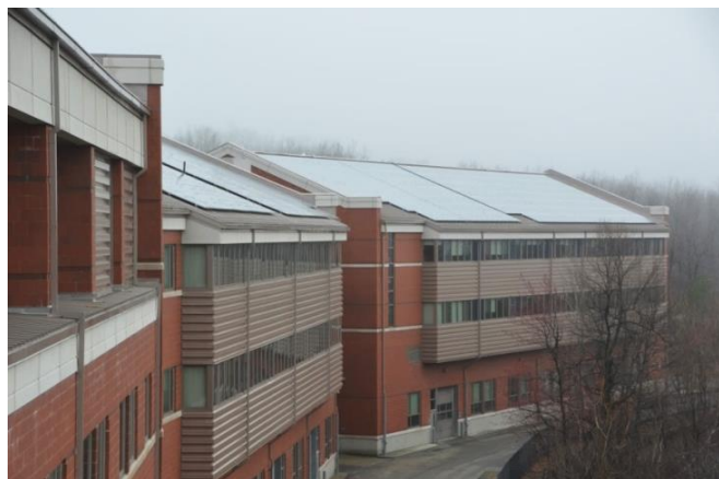
Buildings B-D; solar panels are on the southeast-facing side of their pitched roofs.

The savings from the solar panels translate to approximately $2,700 per month and $35,460 to date in avoidance of electrical costs.