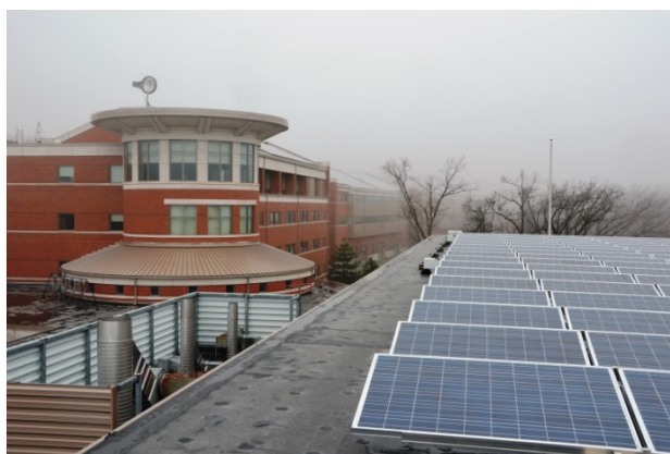
Solar panels on Building A of Worcester Tech.

Student engagement: While students are not allowed to access the school's roof (due to safety and liability issues), the Electrical Program at Worcester Tech has a solar panel on wheels that they bring outside on sunny days to teach about photovoltaic technology.